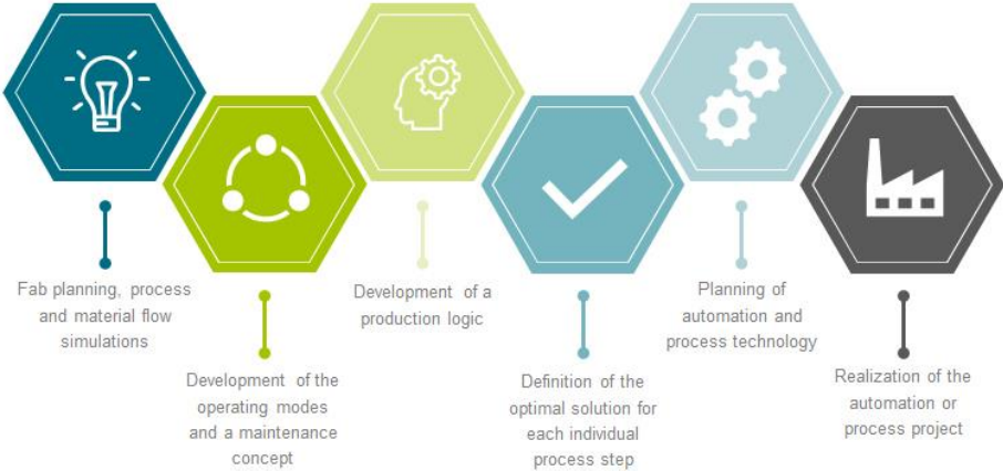
Caption: In 6 steps to the Total Fab Solution